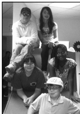
Getting creative at the Children's Museum