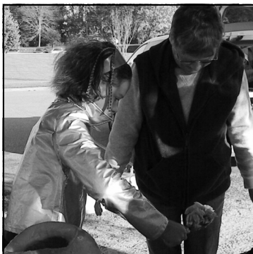
New Math: Buddies + Pumpkin Goo = Pumpkin